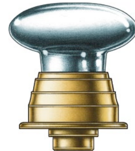
1 3/4" Crystal Knob Shown with Robinson (Stepped) Shank