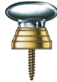
Crystal Shutter Knob Shown without Rose