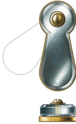
Key Escutcheon with Crystal Cover