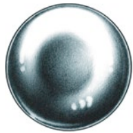
1 1/4" Crystal Cabinet Knob Shown with Nashua (Shell) Shank