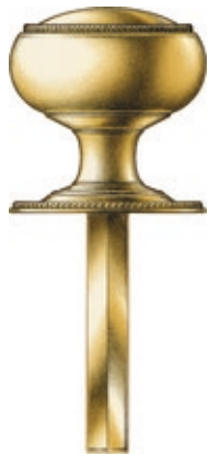
Thumb Turn & Rose