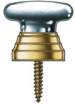
Crystal Shutter Knob Shown without Rose