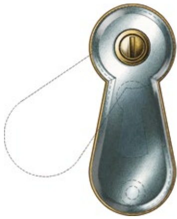
Key Escutcheon with Crystal Cover