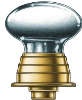
1 3/4" Crystal Knob Shown with Robinson (Stepped) Shank