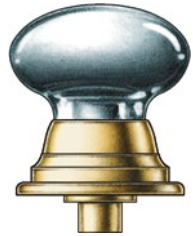
1/4" Crystal Cabinet Knob Shown with Nashua (Shell) Shank