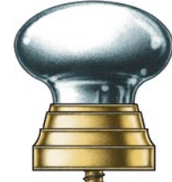
Crystal Shutter Knob Shown without Rose