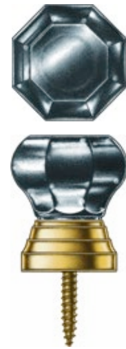
Crystal Shutter Knob Shown without Rose