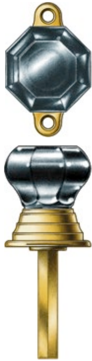
Crystal Thumbturn and Rose