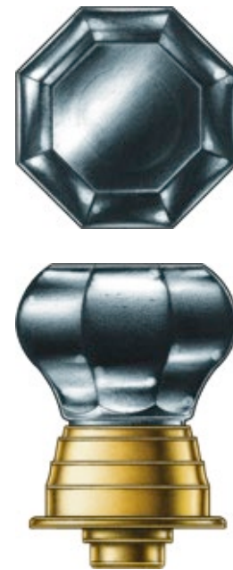
2" Crystal Knob Shown with Robinson (Stepped) Shank