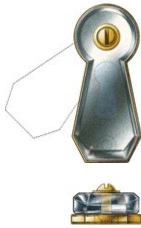
Key Escutcheon with Crystal Cover