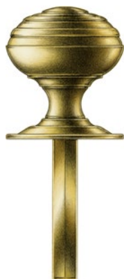
Thumb Turn & Rose