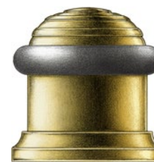
Cylindrical Floor Stop with Trim Ring