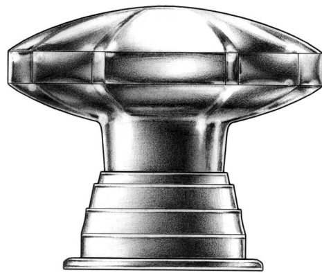
SIZE L 3 × 2 inches