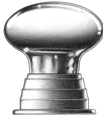
SIZE L 2 1/4 inch Diameter