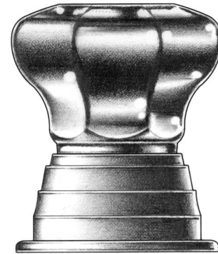
SIZE L 2 1/8 inch Diagonal