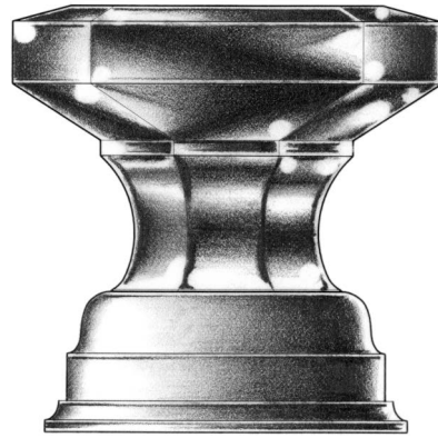
SIZE L 2\frac{1}{2} \times 1\frac{5}{8} inches